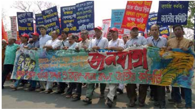
Protest in Bangladesh against NTPC coal plant Rampal

companies to improve their climate risk reporting. These are all laudable steps, but climate risk reports are no guarantee for effective actions to reduce emissions. And green bonds do not undo the damage of investing billions of dollars in companies whose business plans are a blueprint for overshooting the Paris goals and triggering catastrophic climate change.