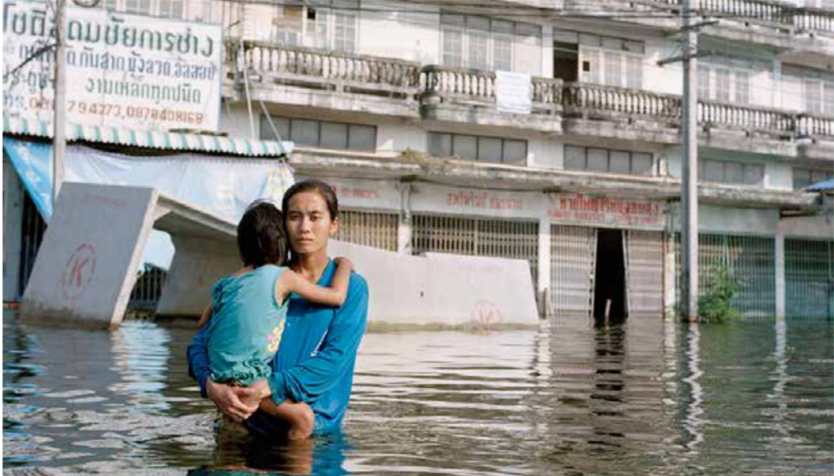
Flooding in Thailand